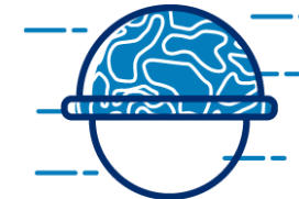
Active Duty Military