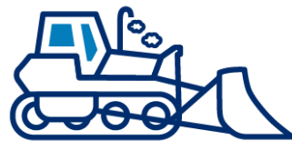
Machinery & Equipment